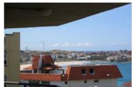
view loss before and after