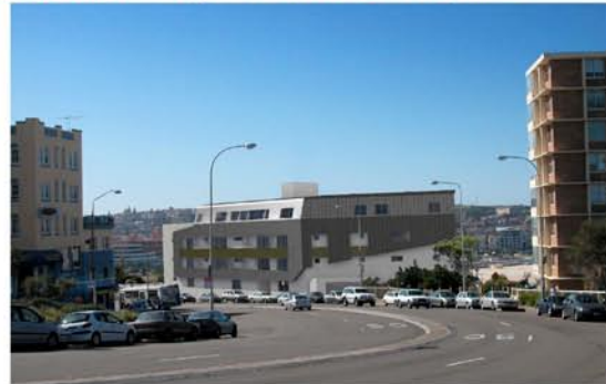
After - The new gateway to Bondi