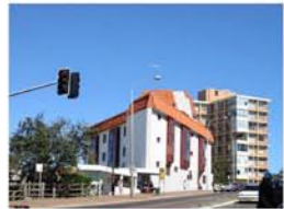
Before - A rundown eyesore?