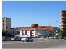
Before - a gateway to Bondi?