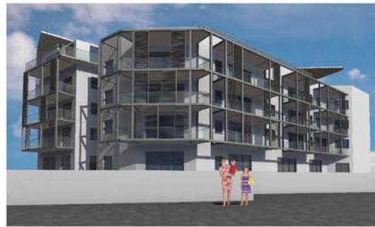
New balconies overlooking Bondi Beach added to 24 of the 42 apartments