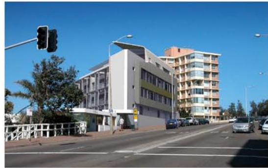
After - (Leaving Bondi)