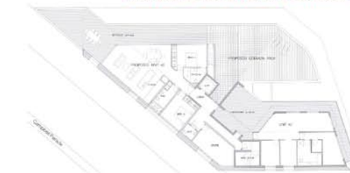
Rooftop Level Plan showing proposed new penthouse